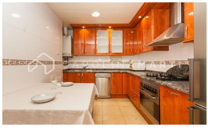
Contact us for more information or to arrange a viewing

Tel: +34 93 241 10 95 <a href="mailto:info@carolinamarti.com">info@carolinamarti.com</a> <a href="mailto:www.carolinamarti.es">www.carolinamarti.es</a>