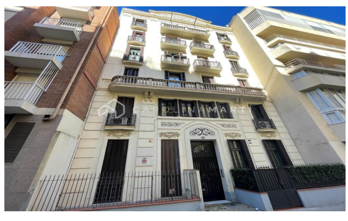
Contact us for more information or to arrange a viewing

Tel: +34 93 241 10 95 <a href="mailto:info@carolinamarti.com">info@carolinamarti.com</a> <a href="mailto:www.carolinamarti.es">www.carolinamarti.es</a>